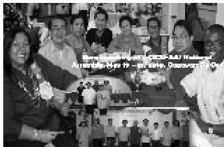
Participants participating in a benchmarking session May 19-24, 2010 with Deaconess OECOC

Mountain View College, as the name implies, is situated on a mountain. Figuratively speaking, it is very a work area. It gives an uplifting atmosphere to the OECOC. The environment abounds with lush and green vegetation while the temperature is perfectly cool. It is working and relaxing.