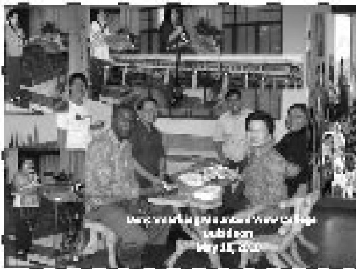
Participants participating in a benchmarking session May 11, 2010