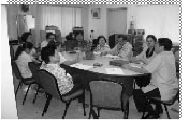
The Internal Quality Assurance Mechanism Committee meets for a meeting in the Office of the Vice President for Academic Affairs.